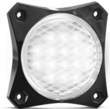
Reverse 88WM2 - Twin Blister