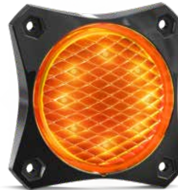
Rear Indicator 88AM2 - Twin Blister