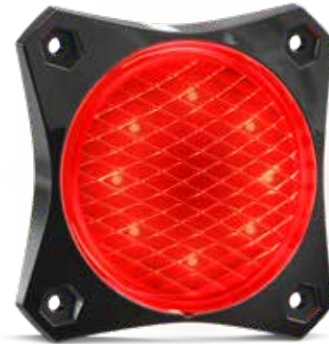
Stop/Tail 88RM2 - Twin Blister

ECE Approved 100% Waterproof 5 Year Warranty